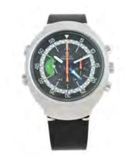
69 SEK 16 000 | € 1 400

EXCELSIOR PARK, chronograph, Cal 4, Case no. 927510, men's wristwatch, 36 mm, steel, manual winding, plastic crystal, leather strap, approx. 1955.