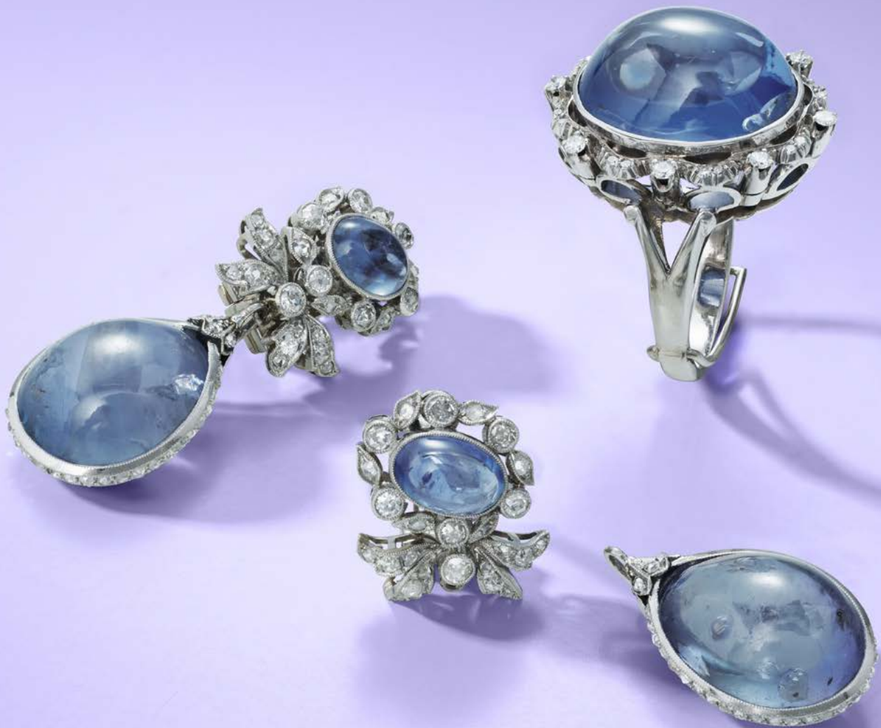
Lot 9, 10