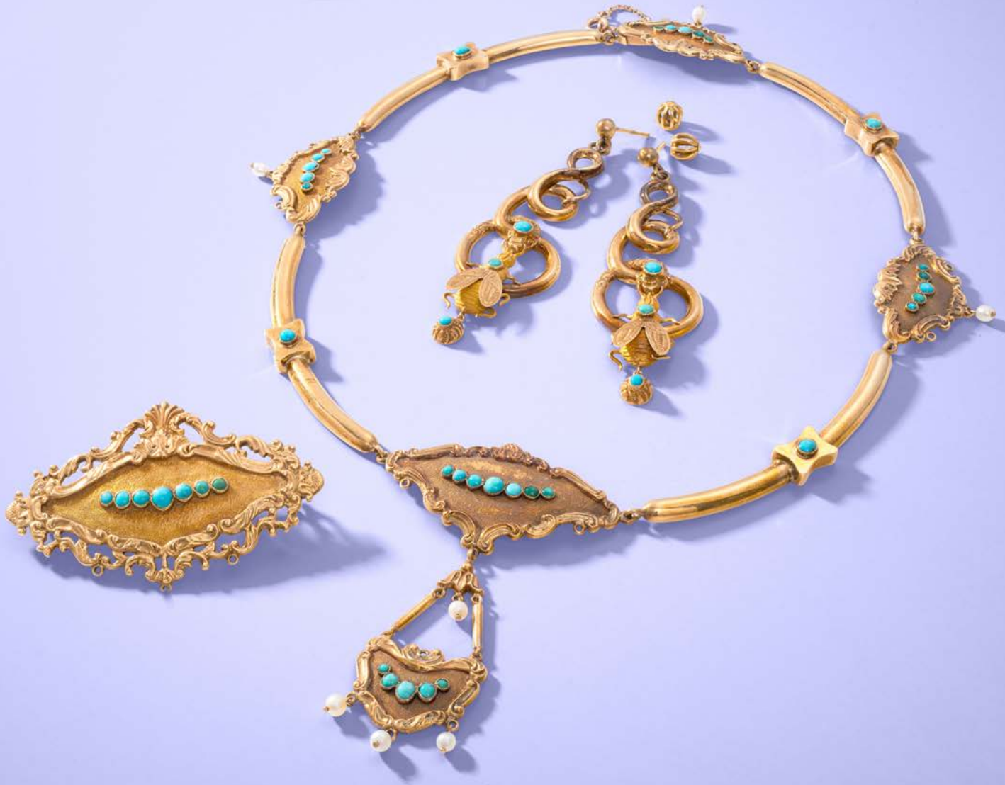
Lot 138, 139, 140